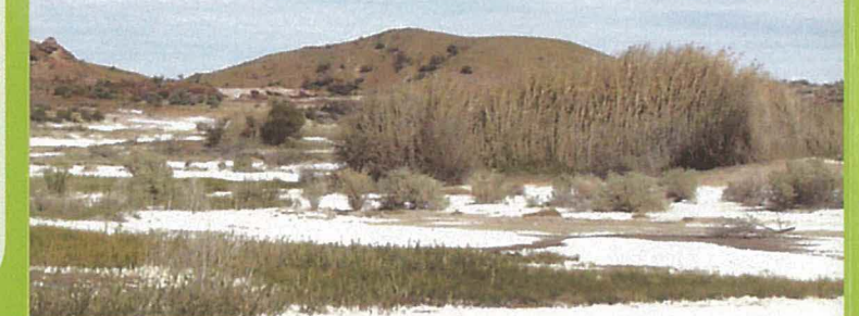
image: Mound springs, dotted all across Arabunna land in South Australia are drying up due to Roxby Downs uranium mine sucking up 30-40 million litres of water each day from the Great Artesian basin.

There is growing pressure on Australia to consider taking back radioactive waste from overseas. Some people want Australia to be the worlds dump as well as the worlds quarry and the more uranium we export the more this pressure will grow .